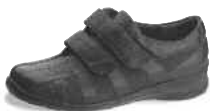
MARY - Black Striped 2 Strap (E830) - Calf skin leather upper - Double strap closure system - Widths available: N, M, W, XW