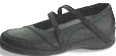
JULIA - Black Wrap Around (E360) - Full grain leather upper - Pebbled texture - Sleek wrap around closure - Widths available: N, M, W, XW