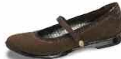
CAROLINE - Brown Single Strap (EE31) - Premium suede upper with elastic gore topline - Adjustable strap closure for optimum fit - Widths available: M,W