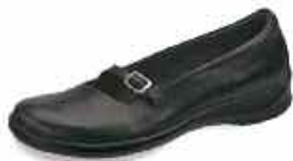
SARAH - Black Buckle (E320) - Full grain "hand-burnished" leather upper - Sleek, stylish buckle design - Widths available: N, M, W, XW