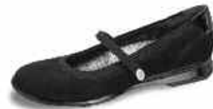
CAROLINE - Black Single Strap (EE30) - Premium suede upper with elastic gore topline - Adjustable strap closure for optimum fit - Widths available: M,W