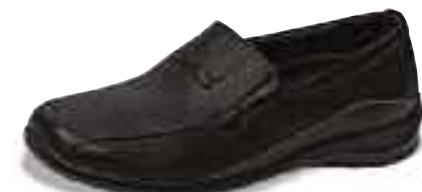
HILLARY - Black Slip-on (E220) - Calf skin leather upper - Elastic gore reduces heel slippage - Widths available: N, M, W, XW