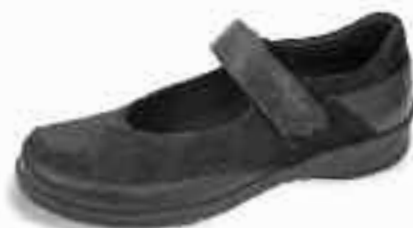
GRACE - Black One Strap (E350) - Full grain leather and suede upper - One-strap closure system - Widths available: M, W, XW