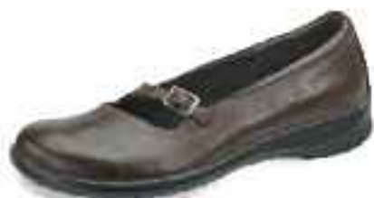
SARAH - Brown Buckle (E321) - Full grain "hand-burnished" leather upper - Sleek, stylish buckle design - Widths available: M, W