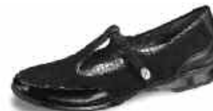
JACKIE - Black T-Strap (EE90) - Premium suede and patent upper - Adjustable t-strap closure for optimum fit - Widths available: M,W