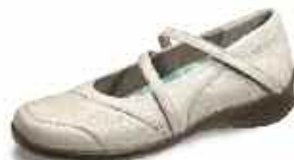
JULIA - Tan Wrap Around (E363) - Full grain leather upper - Sleek wrap around closure - Widths available: M, W, XW