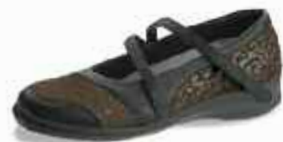
JULIA - Leopard Wrap Around (E367) - Full grain leather upper - Leopard texture - Sleek wrap around closure - Widths available: M, W, XW