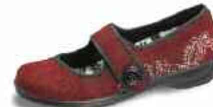
LUCY - Roan Suede Button (E338) - Full grain suede upper - Adjustable strap closure system - Widths available: M, W, XW