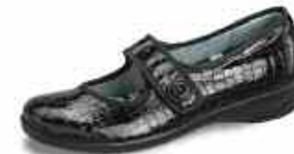
LUCY - Patent Croc Button (E335) - Rich, embossed patent leather upper - Adjustable strap closure system - Widths available: M, W, XW