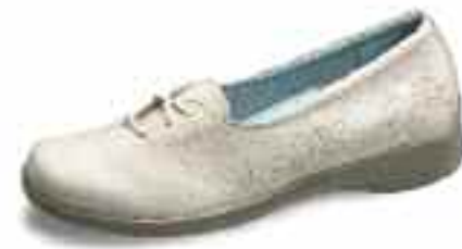
BARBARA - Tan Leather Low Lace (E743) - Full grain leather upper - Stylish low lace closure - Widths available: M, W, XW