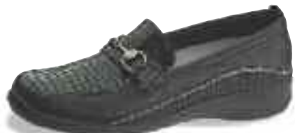
LAURA - Black Alligator Slip-on (E250) - Full grain alligator textured leather upper - Elastic gore reduces heel slippage - Widths available: N, M, W, XW