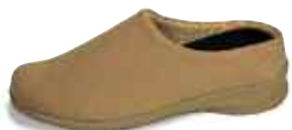
DOLLY - Taupe Stretch Comfort Clog (E194) - Stretchable spandex upper - Open backed, slip-on style - Widths available: M, W, XW