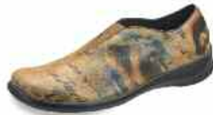
MAGGIE - Tan Printed Slip-on (E269) - Full grain leather upper - Elastic gore reduces heel slippage - Widths available: M, W