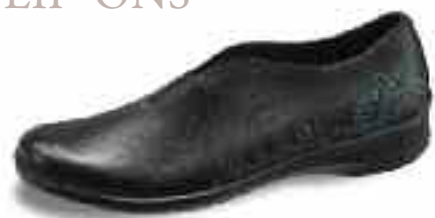
MAGGIE - Black Leather Slip-on (E260) - Full grain leather upper - Elastic gore reduces heel slippage - Widths available: M, W