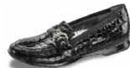
NANCY - Black Buckle Loafer (EE20) - Embossed patent leather upper with elastic gore topline - Slip on with attractive buckle accent - Widths available: M,W