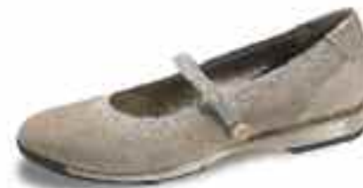
CAROLINE - Taupe Single Strap (EE33) - Premium suede upper with elastic gore topline - Adjustable strap closure for optimum fit - Widths available: M,W