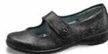
LUCY - Black Leather Button (E330) - Full grain leather upper - Adjustable strap closure system - Widths available: M, W, XW