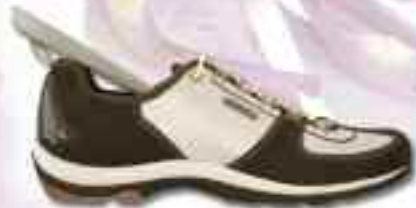
Mozaic Customization Insole