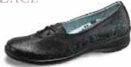
BARBARA - Black Leather Low Lace (E740) - Full grain leather upper - Stylish low lace closure - Widths available: M, W, XW