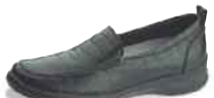
ROSALYNN - Snakeskin Slip-on (E230) - Full grain leather upper - Elastic gore reduces heel slippage - Widths available: N, M, W, XW