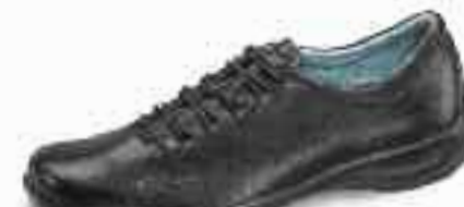
JANE - Black Leather High Lace (E750) - Full grain leather upper - Sleek, classic lace up closure - Widths available: M, W, XW