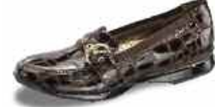
NANCY - Brown Buckle Loafer (EE21) - Embossed patent leather upper with elastic gore topline - Slip on with attractive buckle accent - Widths available: M,W