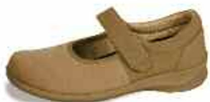
HELEN - Taupe Stretch Mary Jane (E394) - Stretchable spandex upper - One strap closure system - Widths available: M, W, XW