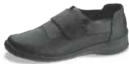
FRANCES - Single Strap (E820) - Full grain leather upper - Single strap closure - Widths available: M, W, XW