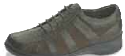
ELIZA - Brown Striped Oxford (E731) - Calf skin leather upper - Stylish lacing system - Widths available: M, W, XW