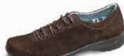
JANE - Brown Suede High Lace (E751) - Full grain suede upper - Sleek, classic lace up closure - Widths available: M, W, XW