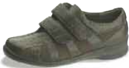
MARY - Brown Striped 2 Strap (E831) - Calf skin leather upper - Double strap closure system - Widths available: M, W, XW