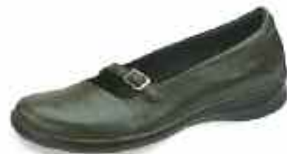
SARAH - Olive Buckle (E327) - Full grain "hand-burnished" leather upper - Sleek, stylish buckle design - Widths available: M, W