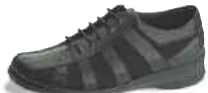
ELIZA - Black Striped Oxford (E730) - Calf skin leather upper - Stylish lacing system - Widths available: N, M, W, XW