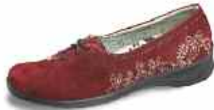
BARBARA - Roan Suede Low Lace (E748) - Full grain suede upper - Stylish low lace closure - Widths available: M, W, XW