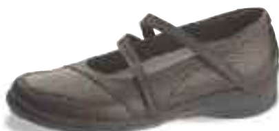
JULIA - Brown Wrap Around (E361) - Full grain leather upper - Pebbled texture - Sleek wrap around closure - Widths available: M, W, XW