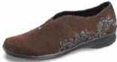
MAGGIE - Brown Suede Slip-on (E261) - Full grain suede upper - Elastic gore reduces heel slippage - Widths available: M, W