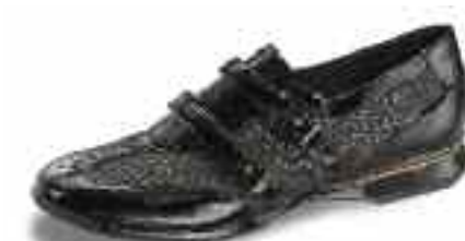
ANNA - Black Double Strap (EE80) - Elegant textile and crinkled patent leather upper - Double adjustable strap closure for optimum fit - Widths available: M,W