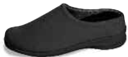
DOLLY - Black Stretch Comfort Clog (E190) - Stretchable spandex upper - Open backed, slip-on style - Widths available: M, W, XW