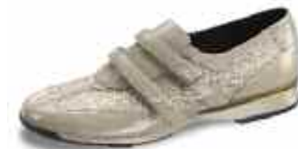
ANNA - Taupe Double Strap (EE83) - Elegant textile and crinkled patent leather upper - Double adjustable strap closure for optimum fit - Widths available: M,W