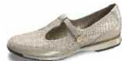
JACKIE - Taupe T-Strap (EE93) - Elegant textile and patent upper - Adjustable t-strap closure for optimum fit - Widths available: M,W