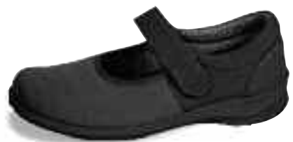
HELEN - Black Stretch Mary Jane (E390) - Stretchable spandex upper - One strap closure system - Widths available: M, W, XW